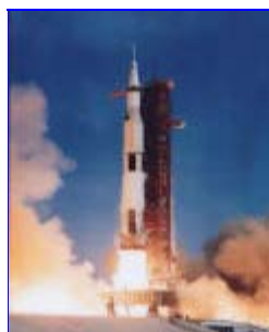
APOLLO 11 LAUNCH #3244U--8x10..$7