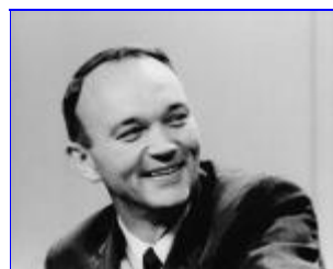
PRESS CONFERENCE #3246U--8x10..$7