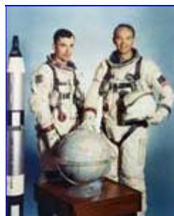
GT10 CREW #3150U--8x10..$7