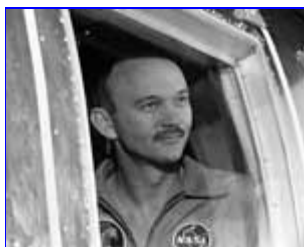
IN QUARANTINE #3251U--8x10..$7