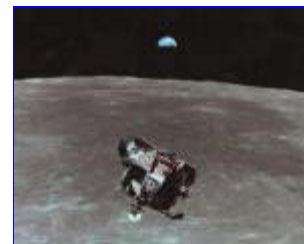
EAGLE ASCENT #3092U--8x10..$7 #3215U--16x20..$55