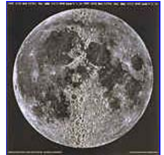
#4095P THE MOON..$25