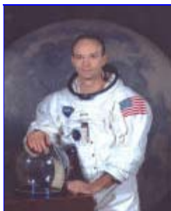
WSS PORTRAIT #3121U--8x10..$7