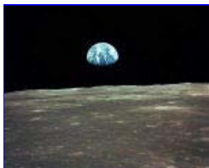
APOLLO 11 EARTHRISE #3151U--8x10..$7 #3152U--16x20..$55