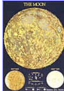
#4094P EURO MOON..$25