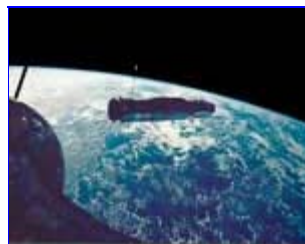
GEMINI 10 AGENA #3076U--8x10..$7 #3077U--16x20..$55