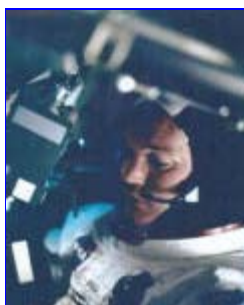
IN COMMAND MODULE #3245U--8x10..$7